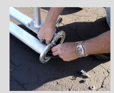
Undo transport bolts

JAG to determine suitable clamps for your application