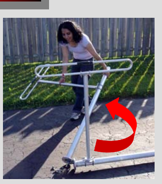
Swing out top element

Site-specific mounting hardware is necessary with theses antennas. Please consult